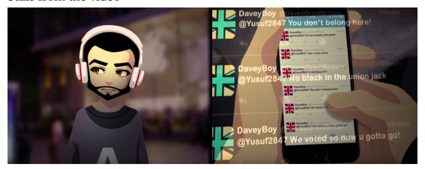
Original source: https://www.youtube.com/watch?v=3QsAiBqtEr0&t=20s