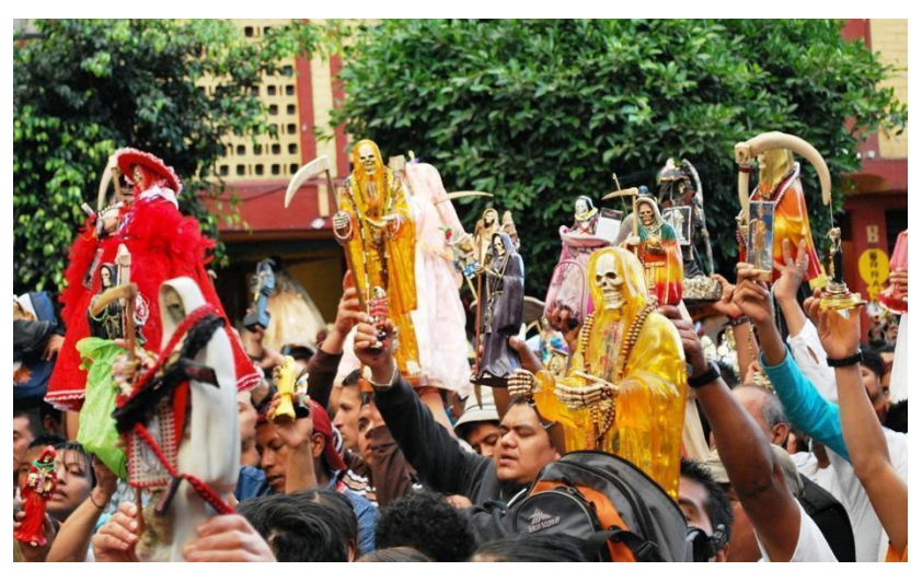
Figure 11. A procession in Tepito, Mexico City venerating Santa Muerte. 97