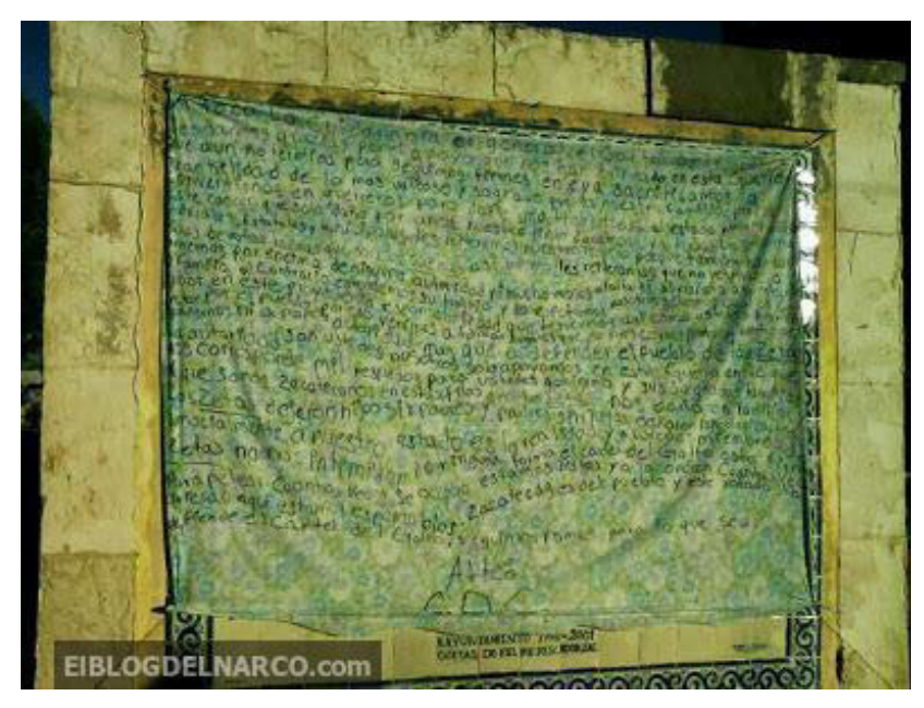
Figure 1. One of thirty Gulf Cartel narcomantas hung on 11 September 2013.64

Cartels use narcomantas strategically and tactically to build support, inoculate against criticism, and discredit competitor cartels. In September 2013, a Gulf Cartel narcomanta attacked Los Zetas cartel while pledging respect for the state and families (see Figure 1 ):