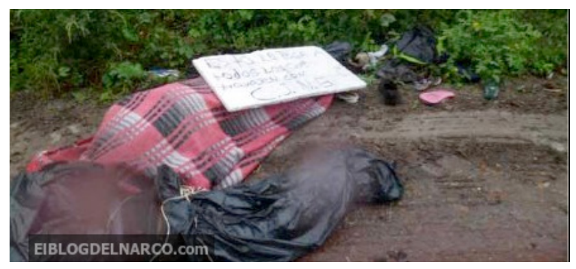
Figure 2. An unsigned narcomensaje found on 18 September 2013, along with two blanketed bodies.<sup>72</sup>