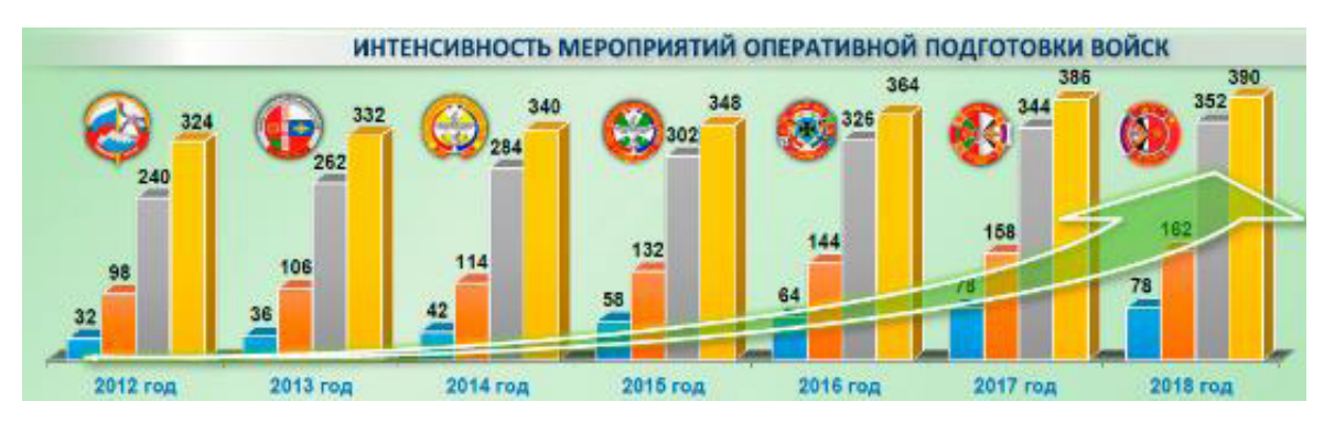
Figure 1. Increased number of operational training events