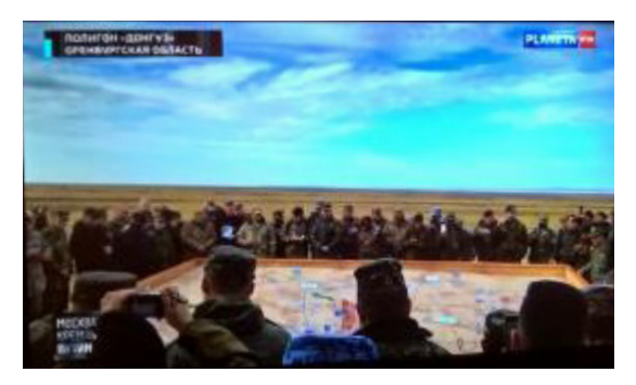
Defence Attachés at 'sand box' briefing, Donguz<sup>144</sup>

A more in-depth look at the messages broadcast by the media reinforces the suspicion that the official coverage of Tsentr 2019 was designed to hide something more important.