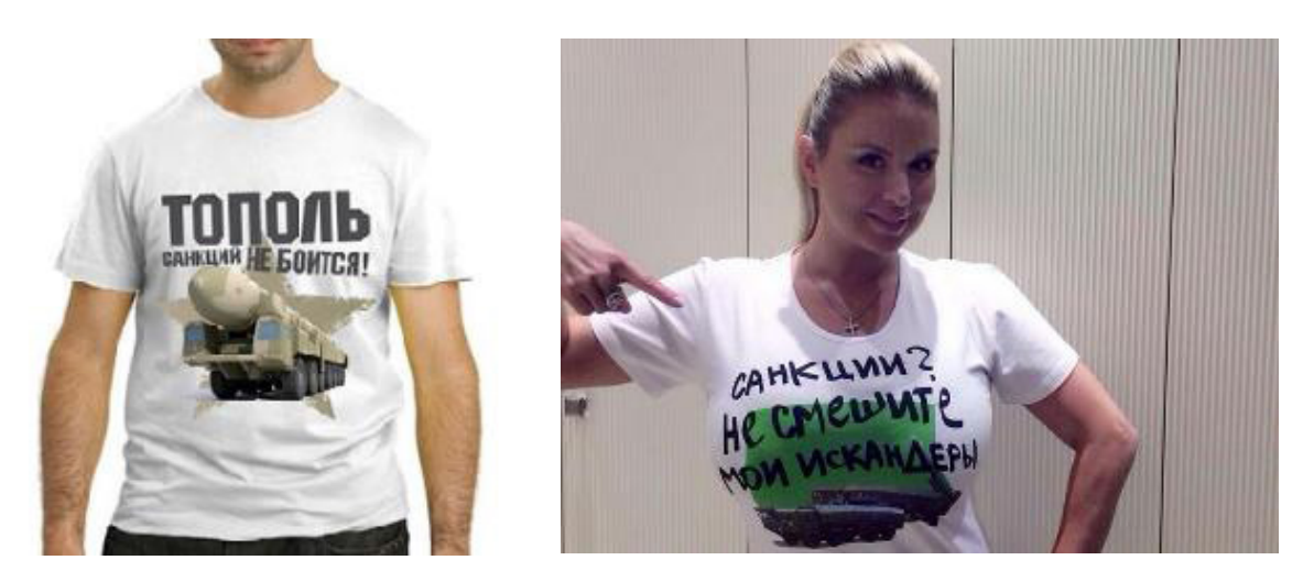
Examples of the "The Topol is not afraid of sanctions", left, and "Sanctions? Don't make my Iskanders laugh", right, T-shirts

For Russia's domestic consumption, Grom 2019 was designed to show off Russia's military might as a global nuclear superpower and feed a sense of national pride. More narrowly, to Russia's elites, it demonstrated that the regime is secure.