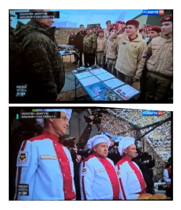
Put in visiting a field kitchen and meeting Youth Army members in \rm Donguz^{_{141}}

organisation 'Youth Army'. The cooks and youngsters - and most probably ordinary Russians - were highly likely to enjoy and take pride in the common touch on display by the President and the Minister of Defence of the Russian Federation.