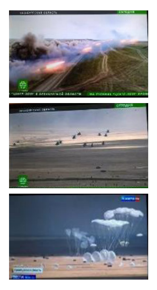
Artillery barrage and air assault in Donguz on Russian TV

During Tsentr 2019, a number of broadcast messages aimed to prove the Russian troops' ability to move quickly, efficiently and over long distances, as noted above. Official military media told the stories of dozens of aircraft relocating to 'operative airfields' within hours, battalion combat teams belonging to remote military units moving to Tajikistan,145 Kazakhstan146 or Kirgizstan,147 Iskander-M missile systems covering distances of more than 1,000 kilometres to perform missile launches,148 149 and large calibre artillery,150 engineers and other units performing combined railway and lone marches. Of course, all of these stories were closely observed and examined by military experts - one of the primary target audiences - in Russia and abroad.