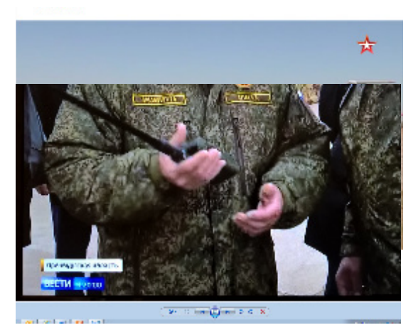
Putin holds an 'Azart' tactical radio in Donguz<sup>131</sup>

Caspian Flotilla<sup>129</sup> in the Caspian and even the demonstration to Putin of tactical radios that were issued to all participating foreign troops to aid tactical interoperability - all these messages emphasised one narrative - that Russia has trusting allies who are willing and able to work together.