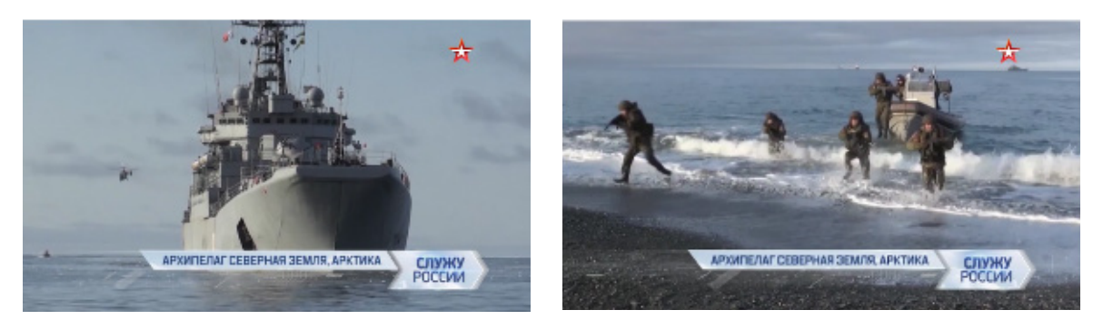
Naval infantry landing on Bolshevik island - information from Russian military TV 'Zvezda' ('Sluzhu Rossii' ('I Serve Russia') programme)

on Bolshevik Island in Severnaya Zemlya took place, it was announced that none of these activities were related to Tsentr 2019 .<sup>127</sup> It remains unclear whether the 'Izvestia' article was trumpeting false capabilities or landing indeed took place but, for unknown reasons, was not advertised. While the Arctic portion of Tsentr 2019 still has to be confirmed, the expansion of the exercise outside Russian borders was obvious.