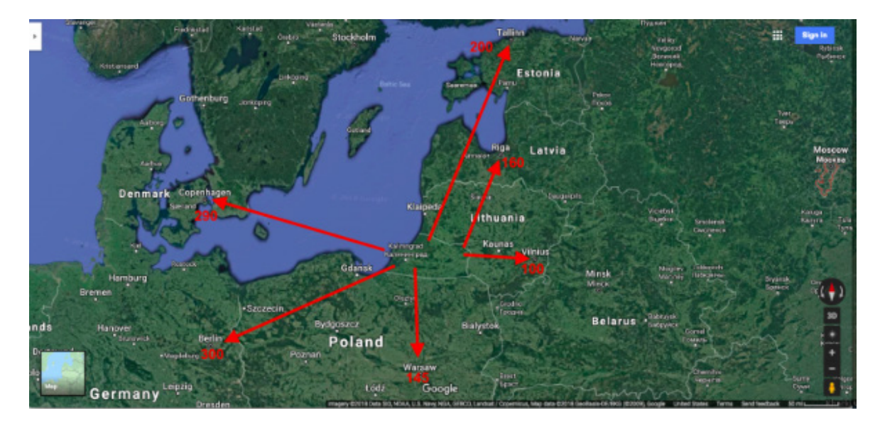
Approximate ranges in miles between Kaliningrad and select NATO capitals

The data above illustrates the hitherto unprecedented scale and scope of Grom 2019. The capabilities and preparedness of most categories of nuclear strike capable assets were apparently tested: most of the land-based ICBMs, along with the naval and air components of the strategic nuclear triad; plus the latest nuclear-capable missile systems, along with possibly other, legacy new, non-strategic nuclear-capable or weapons. The message these factors send to Russia's potential adversaries is that not only is Russia's strategic nuclear deterrent fully operational and more potent than ever before, following its modernisation (and the mobilisation of a significant proportion of it for Grom 2019). It has also been added to with Russia's new range of dual-capable weapons. With both of these elements integrated and tested during Grom 2019, noone is invulnerable.