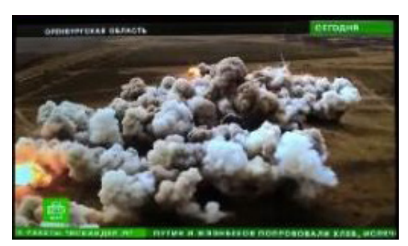
Massive flame-thrower barrage in Donguz<sup>143</sup>

ground, where a 'sand box' briefing aired a scenario in which Russia and its allies had to use all their power to repel an invasion by terrorist state forces. The briefing was followed by a massive air and land assault demonstration, complete with an artillery barrage and air strikes.